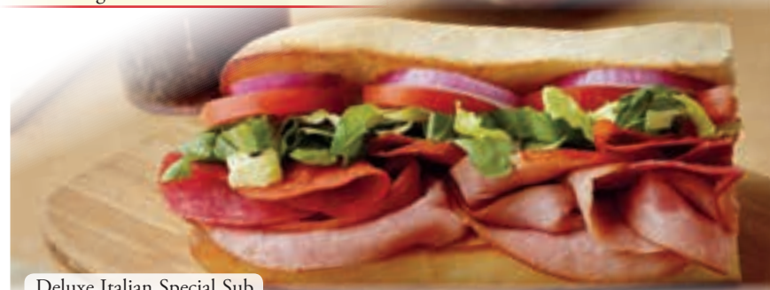
Deluxe Italian Special Sub

Served with your choice of potato or pasta 12.99